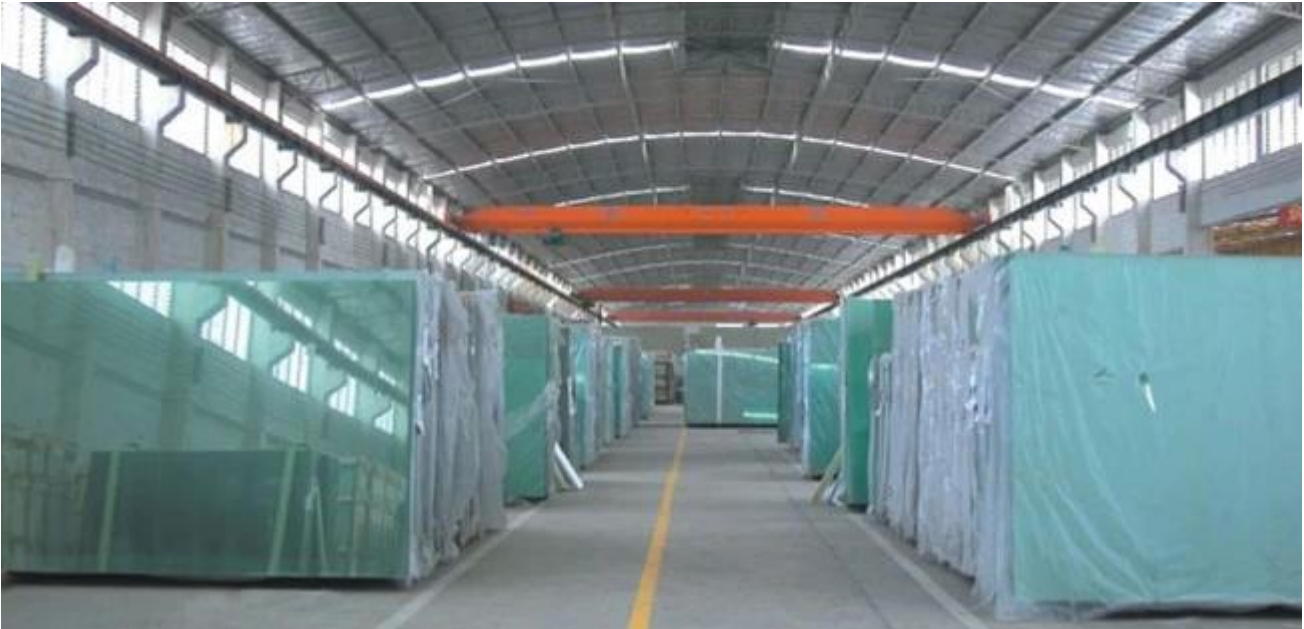
Safety Packaging of Jimmy Glass Factory: