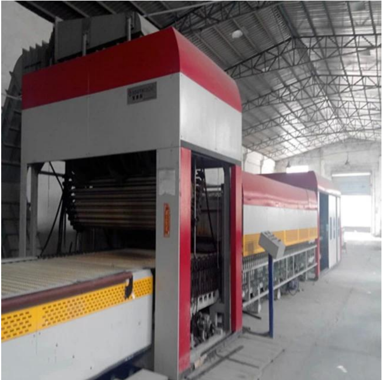
Laminated Glass Production Plant