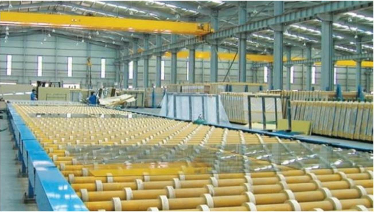
Float Glass Packaging