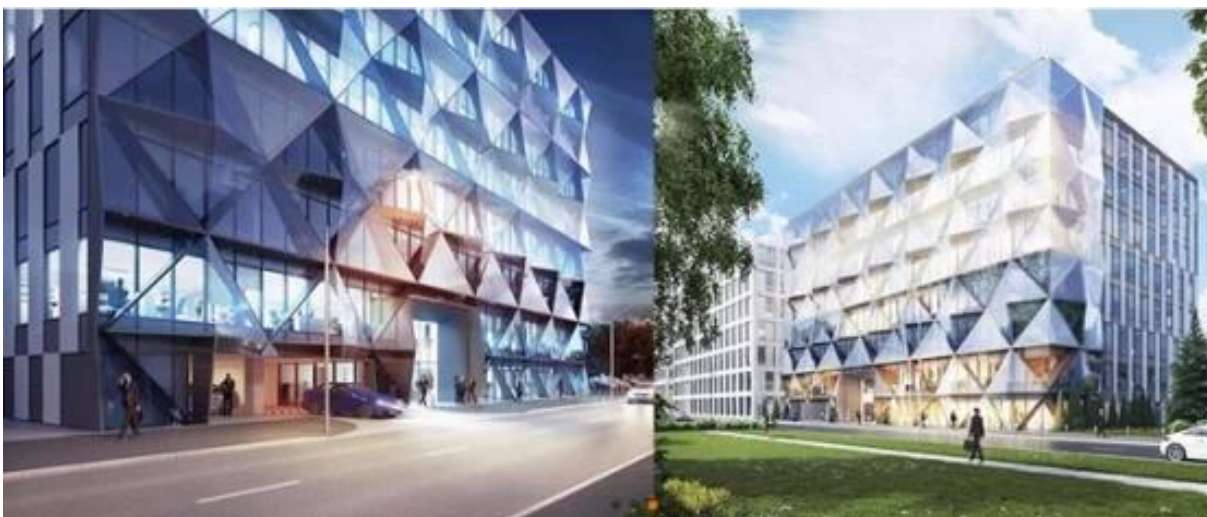
Various design triagngle shape glass project